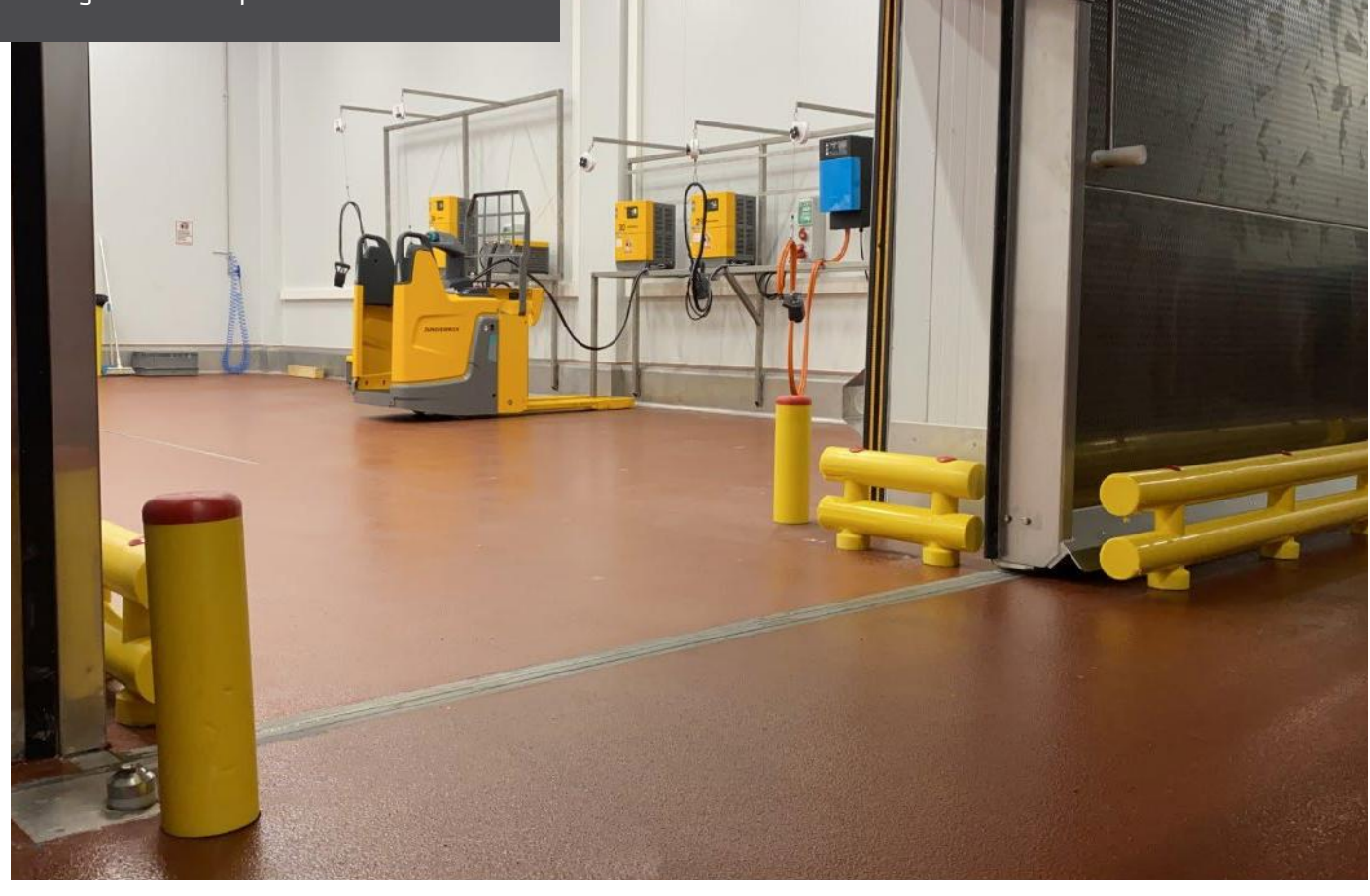
1700m<sup>2</sup> Stonclad GS/HT4 with texture 3 providing an added slip resistance

Stonhard maintains 300 Territory Managers and 175 application crews worldwide who will work with you on design specification, project management, final walk through and service after the sale. Stonhard's single-source warranty covers both products and installation.