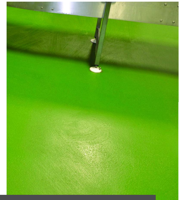
1380m<sup>2</sup> Stonclad UF of co-polymer screed to the desired drainage "falls."