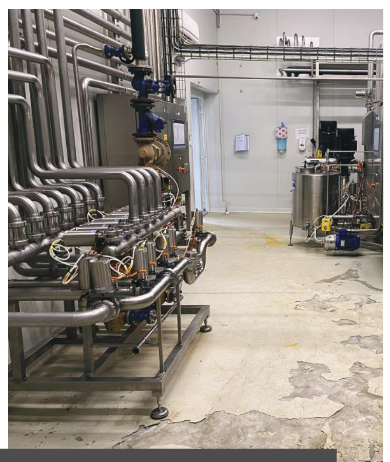
60 m<sup>2</sup> Stonclad UT installation in a challenging area