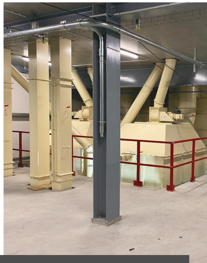
Texture 2 was installed to provide the right anti slip